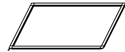
Oblique Drawing 1:2